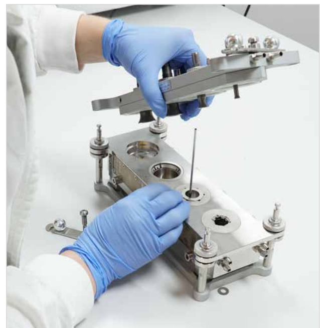
Service tasks are accomplished with technical expertise in a structured process.