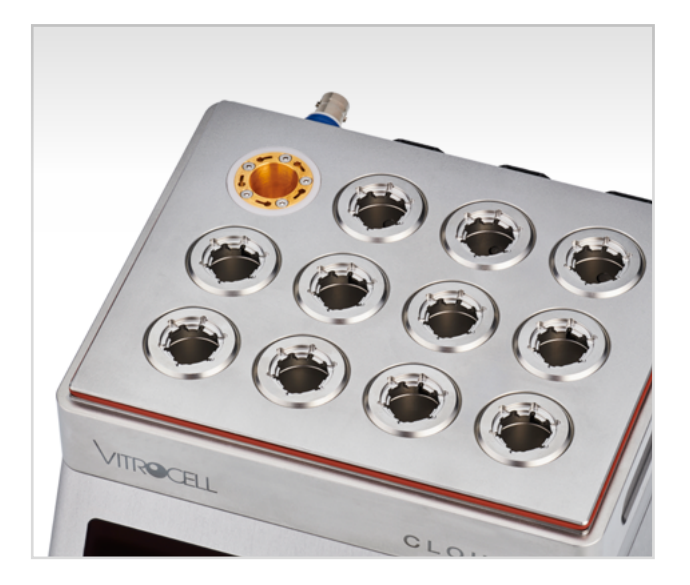
VITROCELL<sup>®</sup> Cloud Alpha 12 for 12 inserts (12-well size) with 9 places for exposure and 3 places for clean air control. Adaptors are available for 24-well sized inserts. Optional dose monitoring with VITROCELL<sup>®</sup> Quartz Crystal Microbalances.