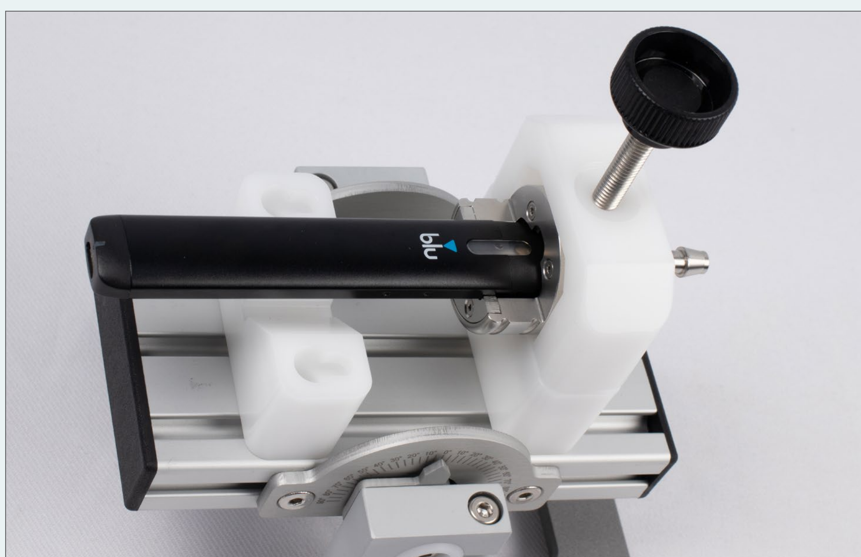
Holder as standalone unit for connection to tubing