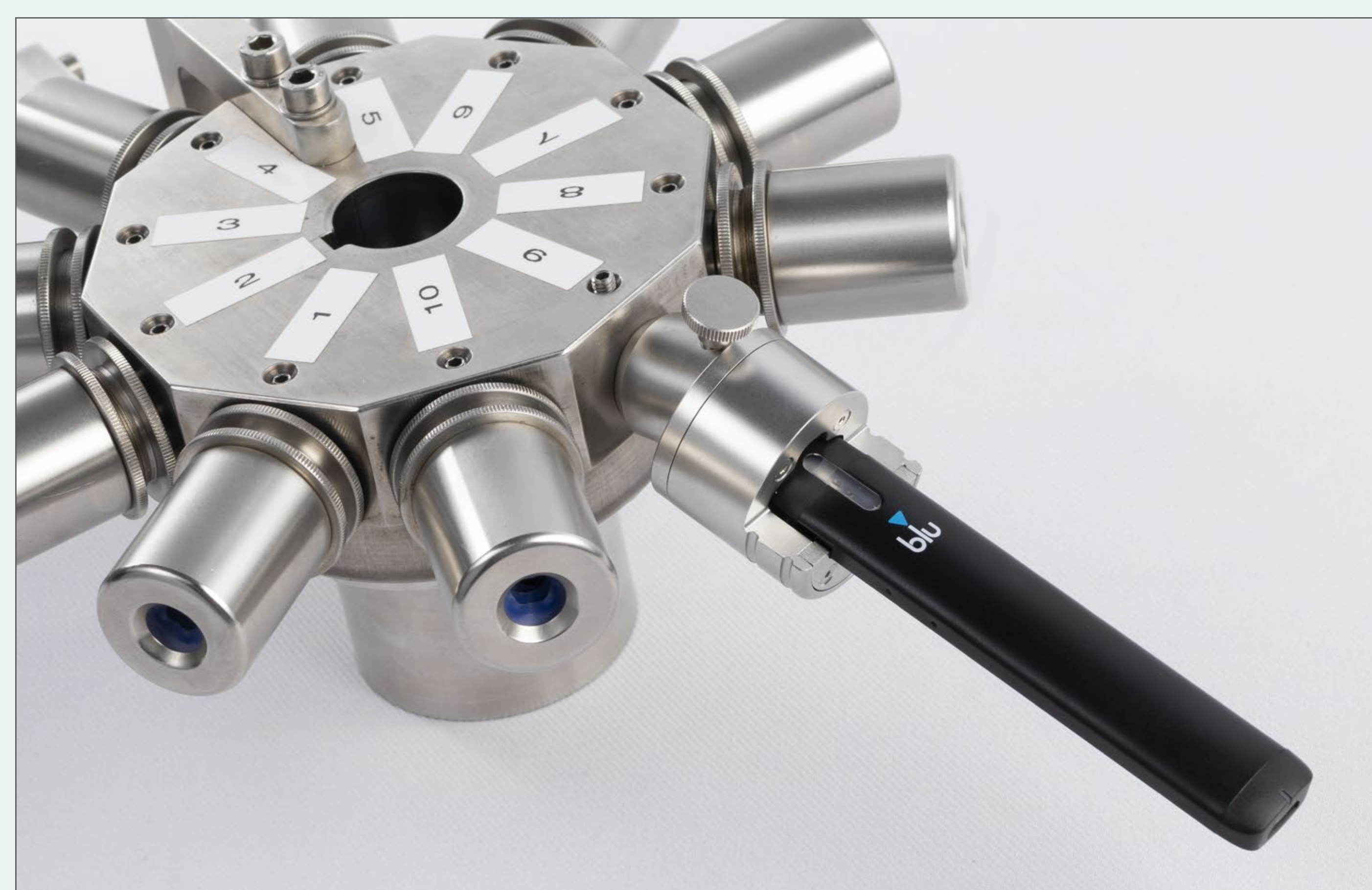
Holder inserted into VC 10 rotary head at an angle of 20°