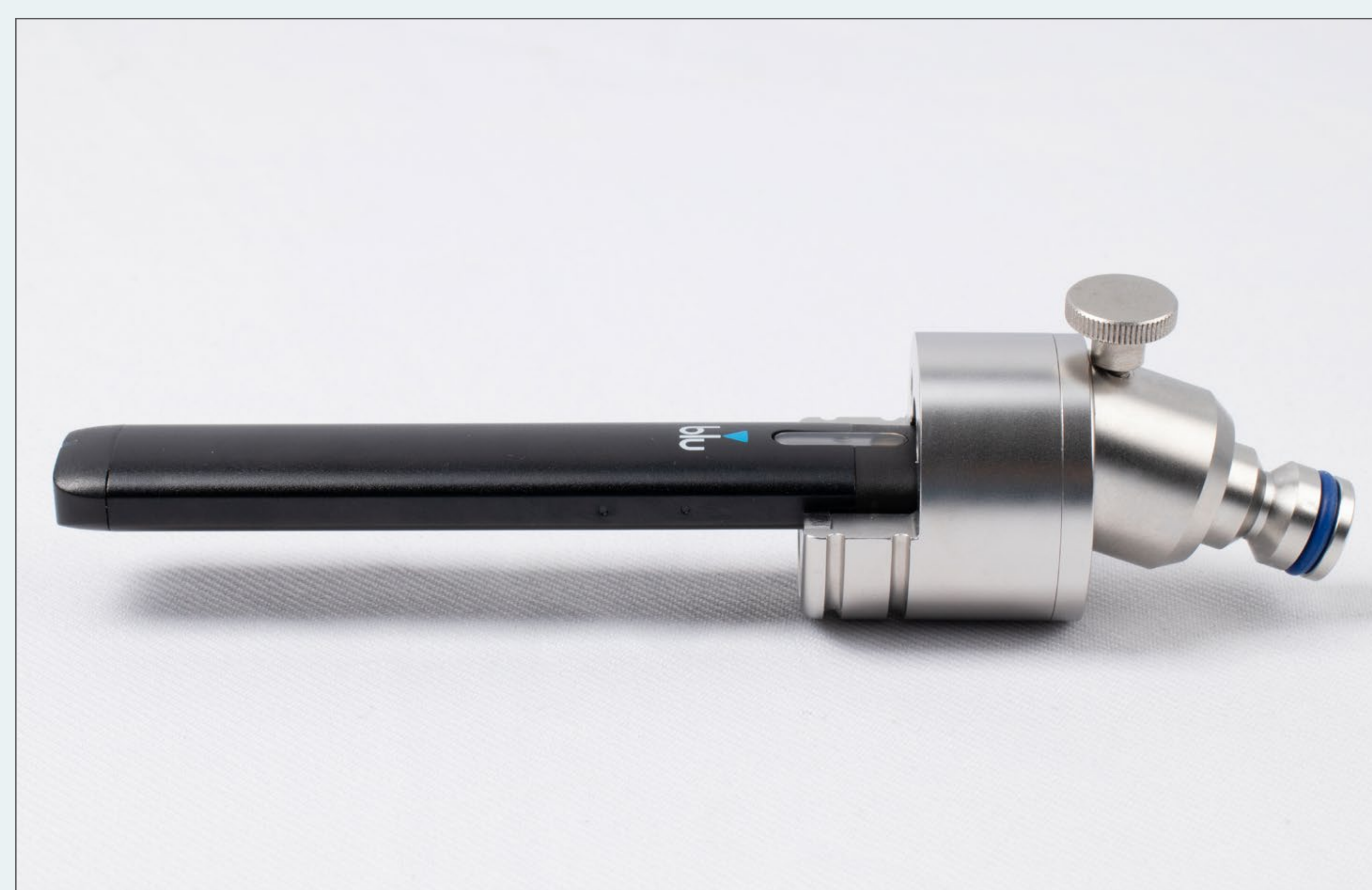
Holder with coupling to VC 10 rotary head