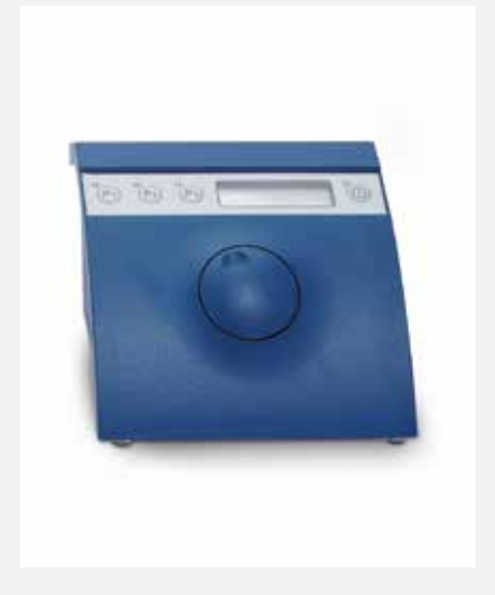
Magnetic stirrer set incl. control unit