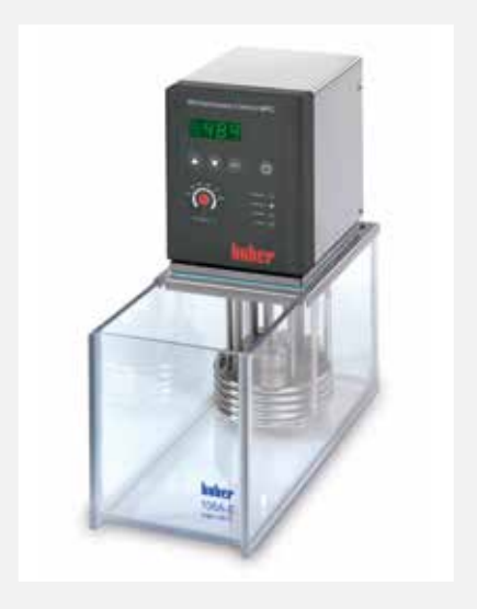
Heating liquid device