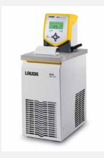
Cooling liquid device