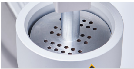
Integrated electrical heating device

The Shisha testing device comes with a set of useful tools for user-friendly operation.