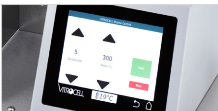
Controller for heating with touchscreen display