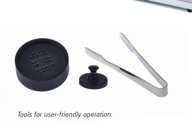
Tools for user-friendly operation.