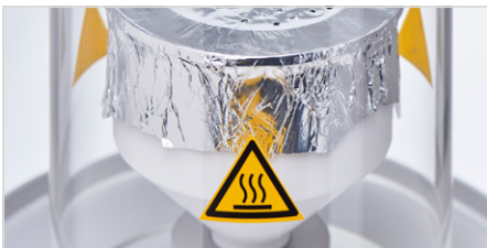
Heating via charcoal