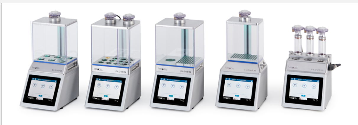
VITROCELL® Cloud Alpha 6