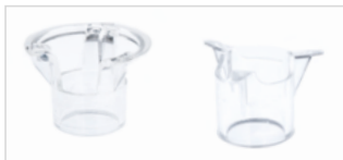
Cell culture inserts (12-well size)