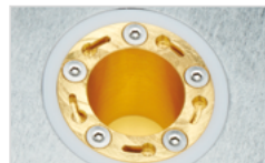
Quartz Crystal Microbalance

VITROCELL® Cloud Alpha 12 for 12 inserts (12-well size) with 9 places for exposure and 3 places for clean air control. Adaptors are available for 24-well sized inserts. Optional dose monitoring with VITROCELL® Quartz Crystal Microbalances.