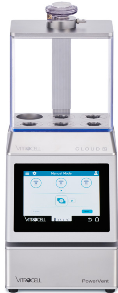
Vitrocell® Cloud Alpha 6 with PowerVent option.