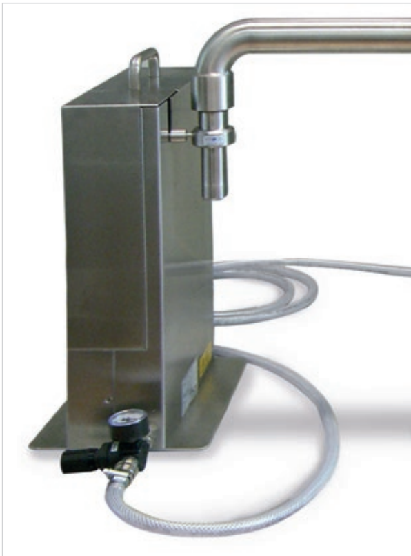
VRBG with cyclone

For the generation of polydisperse solid aerosols from bulk powder material