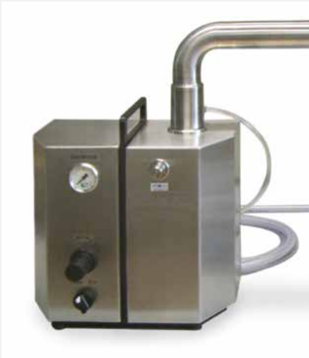
VAGF with drying system

For liquids, suspensions and solutions with defined particle size < 2 \mu\text{m}